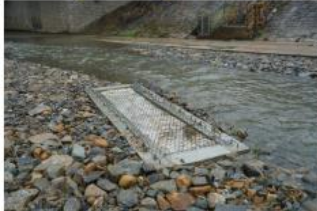
Current Deflector Installation