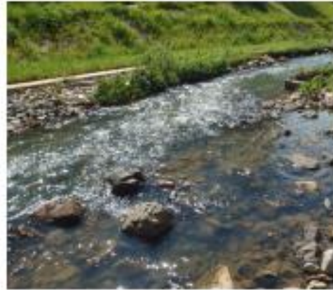
Pools & Riffles Creation