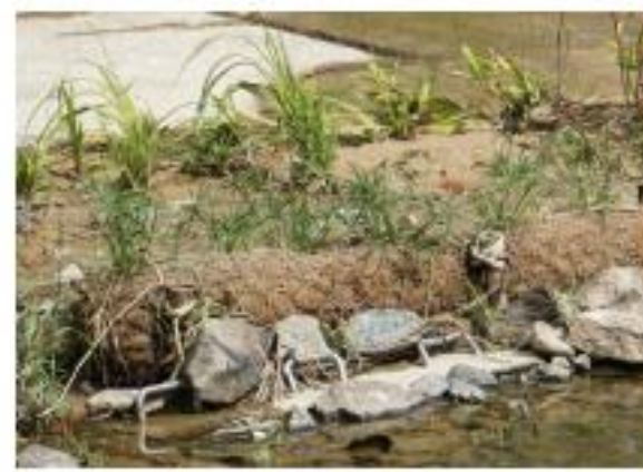
Palm Roll with Planting