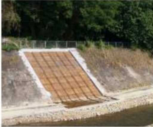
Palm Fibre Concrete Block