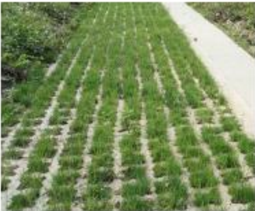
Reinforced Concrete Grid with Grass Planting