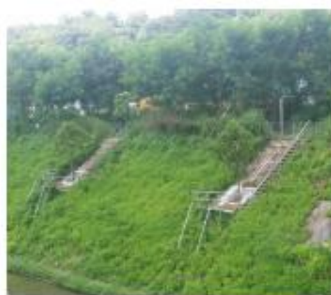
Riparian Tree Planting